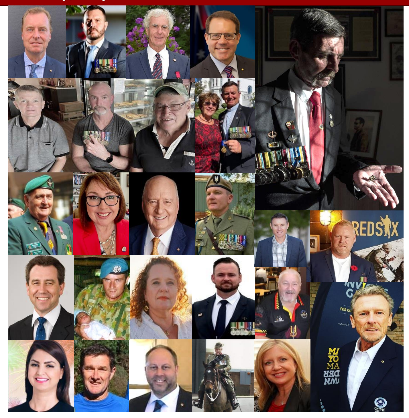
For your Sacrifice - For Our Freedom Thank you