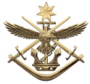
Australian Defence Force