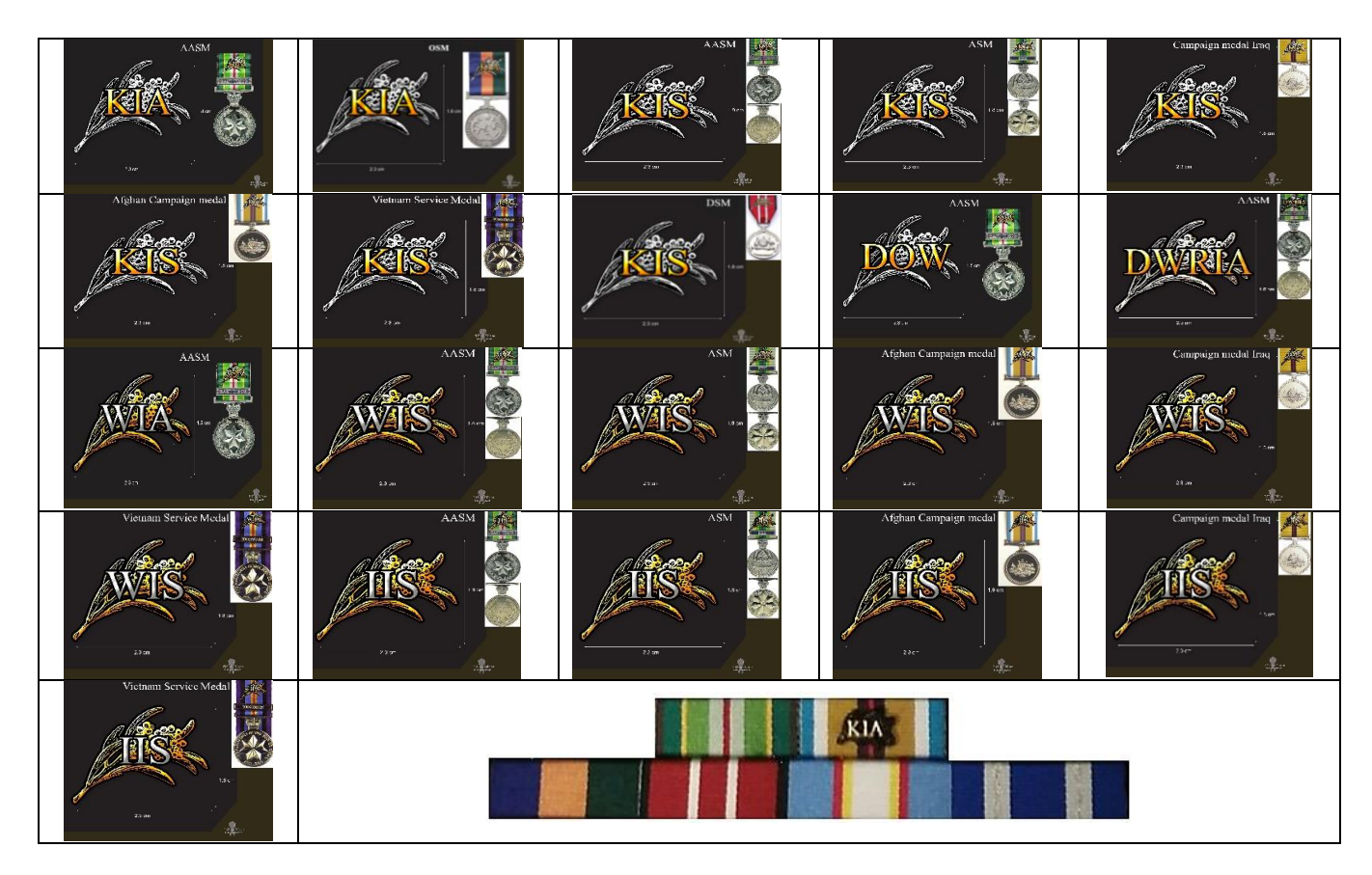
Killed-In-Service (KIS), Killed-In-Action (KIA), Injured-In-Service (IIS), Wounded-In-Service (WIS) or Wounded-In-Action (WIA), Died of Wounds (DOW) and Died of Wounds Received in Action (DWRIA).

A series of prototype medallic clasps shown below were designed by Kerry Danes and produced by Ben Doyle-Cox CEO Platypus Outdoors Group (Platatac) to generate interest in the campaign to honour the fallen. The medallic clasps show how versatile recognising service-related sacrifice could be.